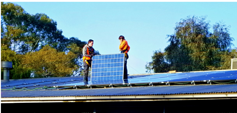
Gawler installation in progress

The second Quick Win project, at the Gawler Community House in SA, was completed in July, 2014. Around 210 people donated via the website to raise the $17,560 for this project, but in practice well over 1,000 people contributed mainly small amounts as part of a $1 Challenge. Embark challenged us to raise $5,000 from at least 1,000 people, then matched it with a $5,000 matching donation from them. Project details are here , and the monitoring system displays the output so far here .