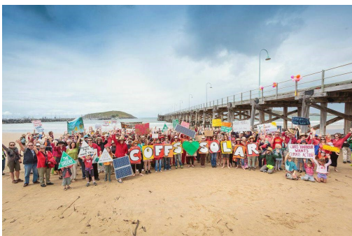
These Coffs Harbour people put $800 in a donation jar at their rally