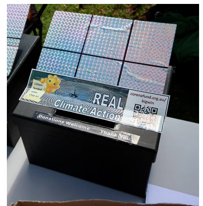
Geelong people put $500 in this beautiful donation box they made for their rally