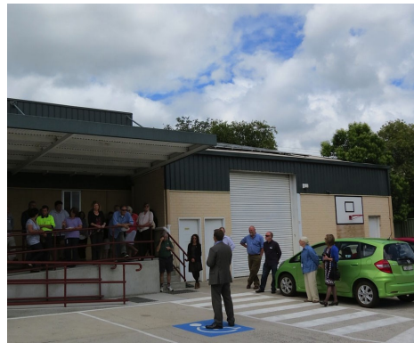
Tulgeen opening ceremony

The second Quick Win project, at the Gawler Community House in SA, was completed in July, 2014. Around 210 people donated via the website to raise the $17,560 for this project, but in practice well over 1,000 people contributed mainly small amounts as part of a $1 Challenge. Embark challenged us to raise $5,000 from at least 1,000 people, then matched it with a $5,000 matching donation from them. Project details are here , and the monitoring system displays the output so far here .