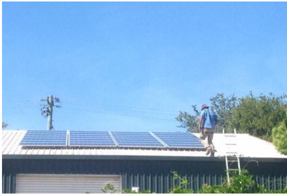
Tulgeen installation almost completed

Tulgeen are repaying the interest-free loan at a rate of $1,000/quarter. The first two repayments helped pay for the second Quick Win project, and the third is helping with the current project.