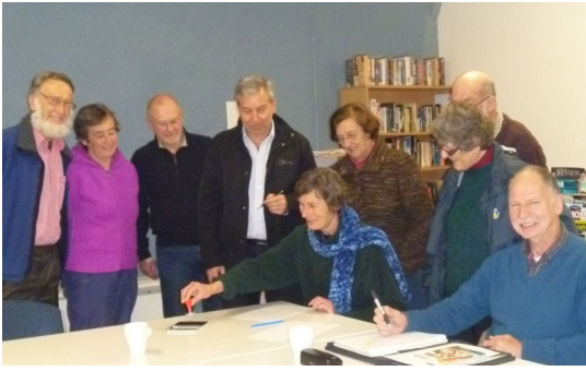
Stamping Gawler loan agreement

CORENA has had a busy 18 months since incorporation in late April, 2013, with the committee meeting every three weeks. I thank them all for their time, their contributions to decisions, and their efforts in promoting CORENA projects.